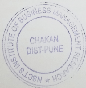
Director & Chairperson, IQAC.